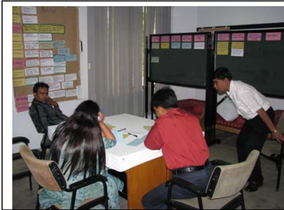
Groups are working with the real cases