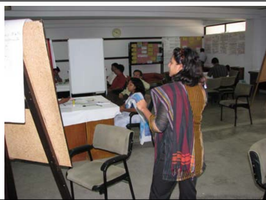
Presentation of a group on the M&E techniques taught in the workshops

At the end of the workshop a final assessment of the various lectures, case studies and the workshop environment was carried out. Finally, the participants received their certificate.